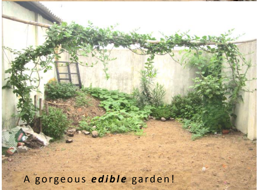
A gorgeous edible garden!