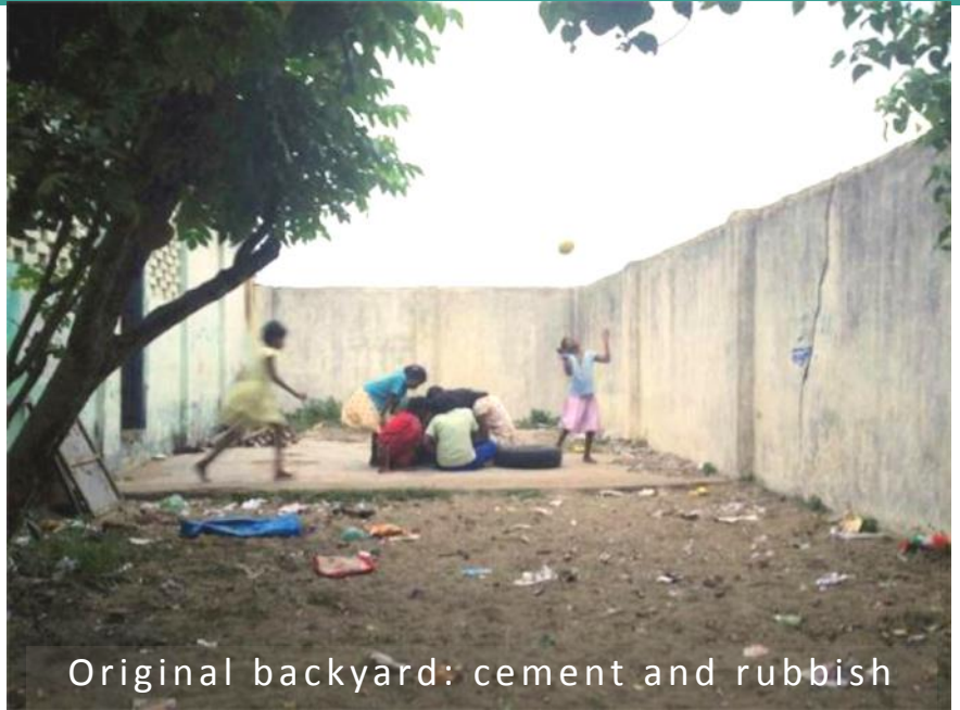
Original backyard: cement and rubbish

A team from reStore Gardens worked with our kids over the last few months to first clean the yard, then remove all the broken cement patches, then turn the sand into soil (a very laborious and painful albeit successful endeavor) and finally sow seeds and watch them grow.