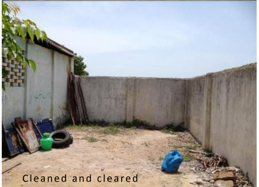
Cleaned and cleared