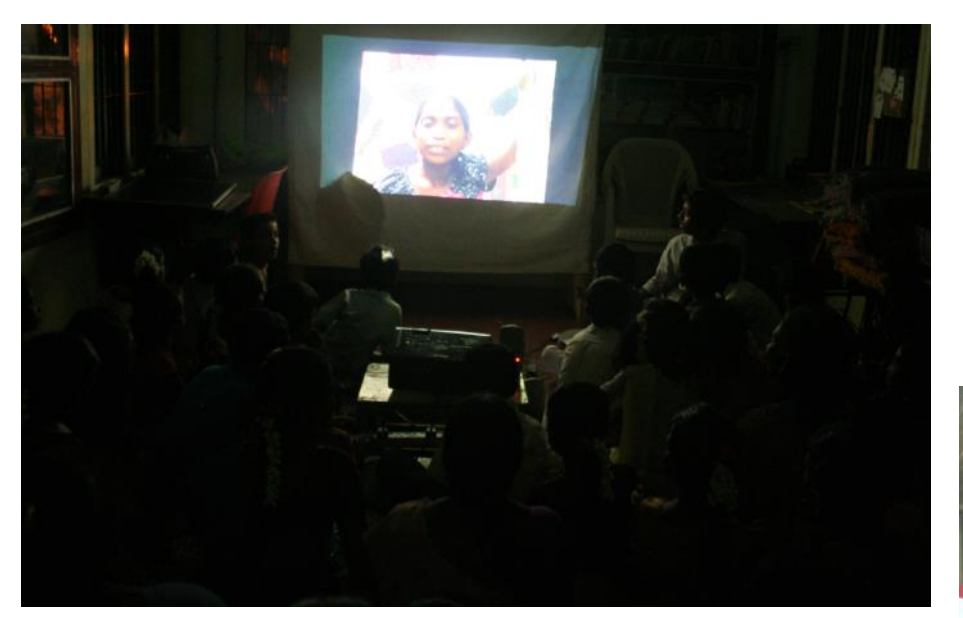
Soon, we should have our own short films!

Documentary filmmaking workshop began as part of the teenager program. The teenagers explored topics of identity, group dynamics within their community, and influence of sports in their lives.