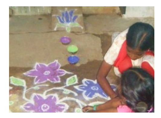
Decorating the earth with bright colors

At Pudiyador, Pongal celebrations are an occasion to bring the entire community together. "Pongal", alluding to the bounty of the harvest season of the Tamil month of Thaii (Jan-Feb), is a four day-long festival celebrated all over in Tamil Nadu, India. This year, the children managed our two-day Pongal festivities from conceptualization to execution. The first day of the festival is known as Bhogi when people ring out the old and bring in the new. On Bhogi all of our children helped with spring cleaning the Pudiyador centers and their homes. One group visited the market to help purchase supplies for the next day's celebrations - the day of Thaii Pongal. They bought rice, milk, pulses, jaggery, cashew, dried grapes, karkandu, sugar canes, and earthen pots. Another group decorated the earthen Pongal pots and the surroundings with beautiful flowers and patterns.