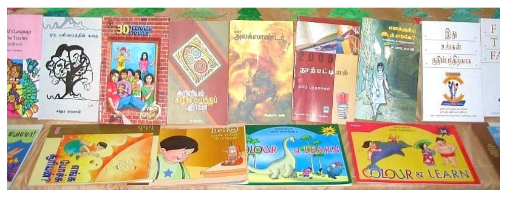
The children proudly displayed some of the books they bought for all of us to see.

The groups reconvened after two hours, to buy the books that the children had shortlisted. One of the most heartwarming moments was when the children decided to pool in the money left over from their individual purchases to buy books for their non-Pudiyador friends in the community at large! On our way back from the book fair, we stopped for a quick post-lunch visit at the Snake and Children's Parks. They visited as many snake, animal and bird enclosures as they could fit in and afterwards thoroughly enjoyed themselves in the play area. We finally said good bye to the setting sun and moved homewards to begin the journey of reading and fun.