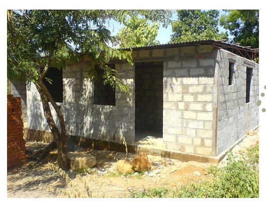
In less than a year, Pudiyador began constructing a new community center five times larger than the previous one. It was designed to comfortably host activities of all the children of the community at once.