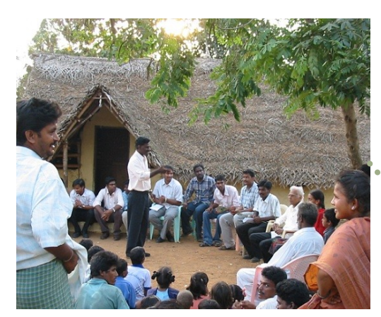
Exactly five years ago, on Mar 31 2005, Pudiyador established contact with the Urappakkam community. The thatched roof hut seen in the background was their "community center".