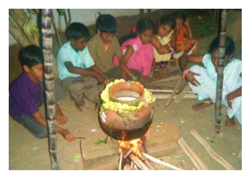
Don't they know? A watched pot never boils :) Children eagerly await the "pongal" moment after which all the goodies will be theirs to enjoy and share.

At Pudiyador, Pongal celebrations are an occasion to bring the entire community together. "Pongal", alluding to the bounty of the harvest season of the Tamil month of Thaii (Jan-Feb), is a four day-long festival celebrated all over in Tamil Nadu, India. This year, the children managed our two-day Pongal festivities from conceptualization to execution. The first day of the festival is known as Bhogi when people ring out the old and bring in the new. On Bhogi all of our children helped with spring cleaning the Pudiyador centers and their homes. One group visited the market to help purchase supplies for the next day's celebrations - the day of Thaii Pongal. They bought rice, milk, pulses, jaggery, cashew, dried grapes, karkandu, sugar canes, and earthen pots. Another group decorated the earthen Pongal pots and the surroundings with beautiful flowers and patterns.