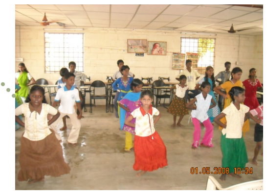
This is a great space for holding group activities & classes. The women folk use this building to hold community meetings and learn and practice yoga. On special days, the entire community gathers to watch their children perform!