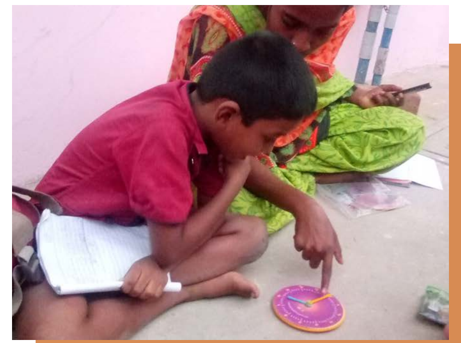
Uma playing the "clock" game with a child to test his knowledge of 5-tables

We needed to know how they were faring, whether they are responding well to our programming, where we can improve, which children needed extra help.