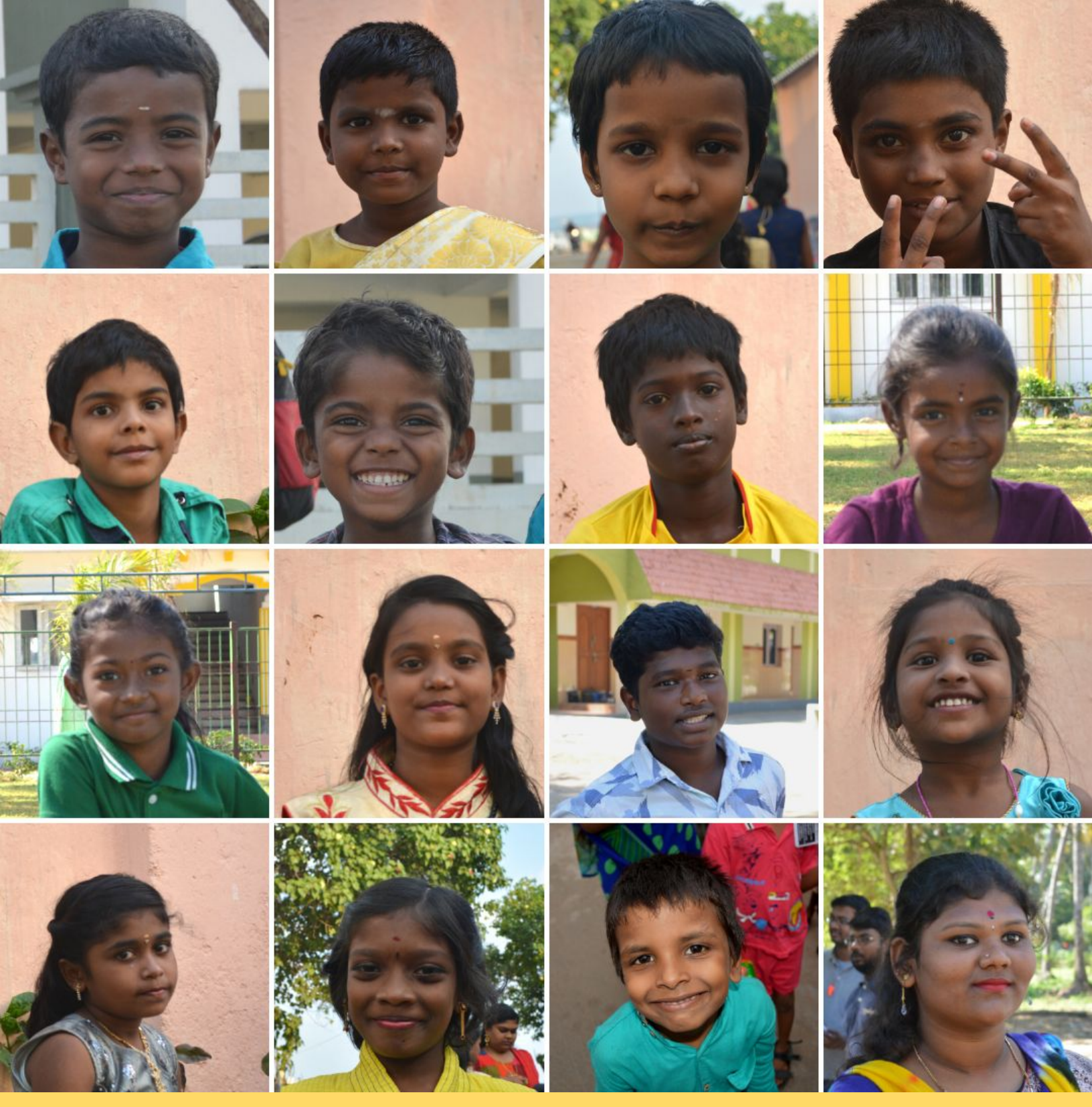
SENDING SMILES AND LOADS OF POSITIVE ENERGY FROM CHENNAI TO YOU!

WE WILL GET THROUGH THIS. WE LOOK FORWARD TO COMING BACK STRONGER THAN EVER.